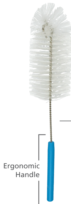
REUSABLE JAR/BOTTLE BRUSH